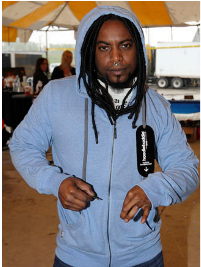
Top Left: Member of Finger Eleven with Rock On. Top Right: Member of Hollywood Undead wearing Dirtee Hollywood. Bottom Left: Guitarist of 10 Years drinking Bella Voda Water. Bottom Right: Lead Singer of Sevendust wearing HoodieBuddie.